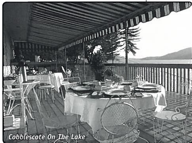
Cobblescote On The Lake

Outdoor enthusiasts will make a beeline for the miles of hiking trails and swimming and boating activities and music aficionados will want to attend the world famous Glimmerglass Opera (☎ 607-547-2255, 1257, www.glimmerglass.org) in July and Aug. Note: It was James Fenimore Cooper who dubbed Lake Otsego as Lake Glimmerglass in his Leatherstocking Tales .