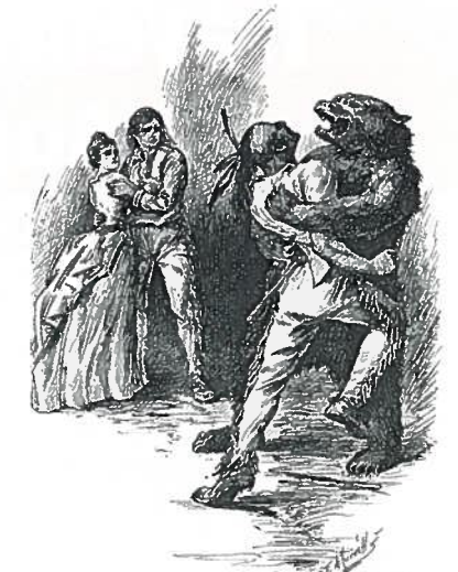
Illustration from the 1896 publication of "The Last of the Mohicans."

Cooperstown & Charlotte Valley Railroad (☎ 607-432-2429, www.lrhs.com) in Oneonta (NY) has train rides, train robbery enactments and live blues. Contact for ever-changing schedule.